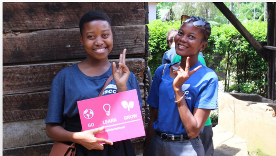
NSCC International Learning Program The Happiness Project, UN Sustainability Goal #5